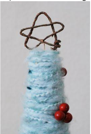
14) Add bird, nest and any other accessories desired to the tree using pins.

13) Poke the end through the top of the tree.