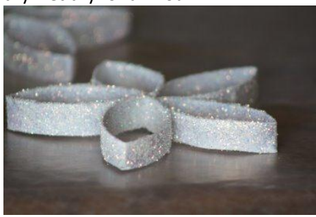
7) Admire your work!

6) Sprinkle each star with glitter. Lay stars out on wax paper or somewhere clean, cool and dry. Let dry for an hour.